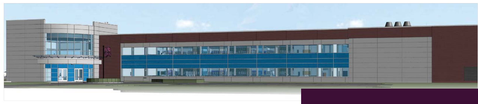
Kemin's new Des Moines, Iowa, research and development facility includes two general labs, six shared labs and three pilot labs, in addition to an existing 1,200-square-foot Innovation Center laboratory.

laboratory. The state-of-the-art facility will provide 1,215 linear feet of laboratory bench space for approximately 60 scientists. There are several unique features in the new building, including a sensory lab and test kitchen for the company's food technologies division.